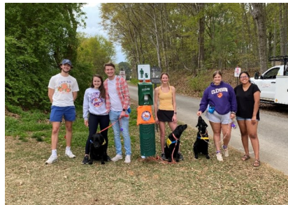
Canine Companions, as well as students, helped install 2 of the 3 stations. Educational pamphlets and stickers were handed out to students along with treats for the dogs.