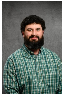
Brian Manning Utilities